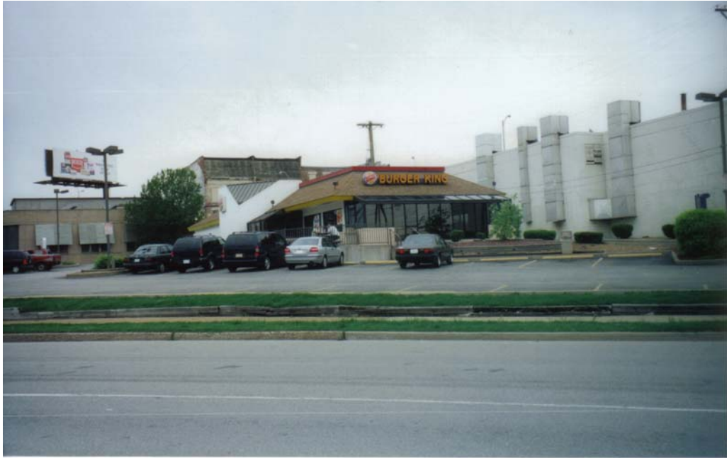
View from Broadway looking northwest (above)